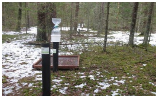
Photo 2. Monitoring of litter fall and through-flow water in a forest in the experimental site.

Norway spruce trees demonstrated the most significant increase in annual basal area increment (BAI), followed by Scots pine trees. In contrast, silver birch and downy birch trees demonstrated stable or decreasing rates, respectively in the BAI in the period studied in northeastern Lithuania.