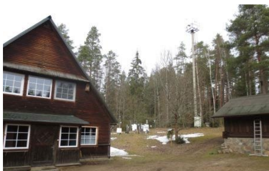
Photo 1. A view of monitoring of environmental conditions (PM 10 , PM 2.5 , O 3 , NO x CO 2 etc, with student dormitory and laboratory.

Data on tree crown conditions between 1993-2020 revealed that after an initial period (1993-1999), when defoliation levels were the highest, the condition of the monitored trees improved in the studied forest sites. This process continued from 2012-2015 (i.e., crown defoliation of birch trees decreased from 22.7% to 14.5%). This improvement in crown conditions was statistically significant ( p < 0.05 ). Decrease in mean defoliation of Norway spruce and Scots pine crowns was close to a level of significance, i.e., defoliation decreased from 24.5% to 22.3% and from 16.8% to 15.8%, respectively. The year 2020 was the best for tree crown conditions in the studied forest sites. The mean value of defoliation in all monitored trees decreased by 19.4%.